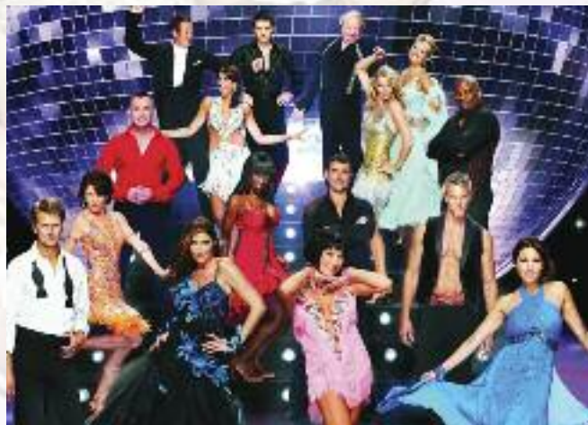
Back row L to R: Austin Healey, Tom Chambers, John Sergeant, Gillian Taylforth. Third row L to R: Gary Rhodes, Christine Bleakley, Jodie Kidd, Don Warrington. Second row L to R: Cherie Lunghi, Heather Small, Phil Daniels, Mark Foster. Front row L to R: Andrew Castle, Lisa Snowden, Jessie Wallace, Rachel Stevens

With so much going on, it is hard to believe Camilla also managed to launch her own fitness DVD Dance Off the Inches at the end of last year. She is also planning a summer theatre tour with professional partner Ian Waite called Dance Fusion , which promises a combination of street and ballet with their more familiar ballroom and Latin routines. The urban dance group Flava, who appeared on last year's Britain's Got Talent television show will also be taking part and to cap it all, Camilla also has a new dance recruit in the form of her partner, actor Kevin Sacre. "He really wants to learn to dance. Every time he saw a new dance during the last series of Strictly he'd say, 'I'd like to learn that one too.' As he's an actor, maybe we can swap lessons!"