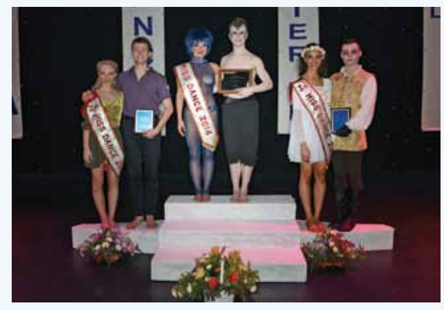
Miss Dance and Dance Master Winners and Runners-Up