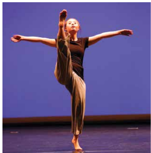
Magpie Dance (Youth Group)

Find out more about Dancers' Career Development by going to www.thedcd.org.uk