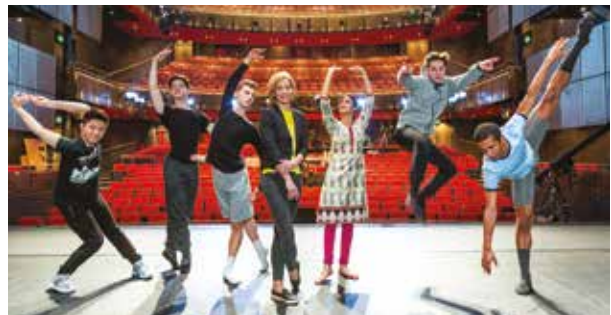
The BBC Young Dancer 2017 finalists on stage with Darcey Bussell

Any entrant who the BBC (in its absolute discretion) considers unable to cope with the stress or other demands of BBC Young Dancer 2017 will not be able to take part. If you are unable to take part in any stage for any reason including illness, injury or other eventuality then the BBC reserves the right to substitute an alternative entrant for part or the remainder of the competition (in the BBC's sole discretion).