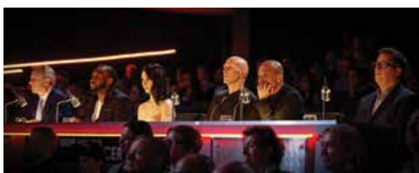
The judging panel at the BBC Young Dancer 2015 Grand Final

Television cameras will be present to record the Second Round, Category Finals, Workshops and Grand Final of BBC Young Dancer 2017. You will also be contacted by the BBC and interviewed on camera at various stages. Interviews and/or your performances will be recorded for possible use on television, radio and online. We may also take photographs of you for use or in connection with the programmes.