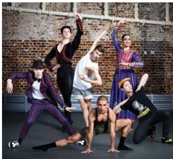
The BBC Young Dancer 2015 finalists

All venues used by BBC Young Dancer will have a performance area of at least 10m x 10m.